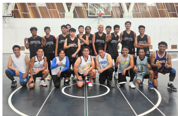
Group shot of Men's Category volleyball players for CS Week