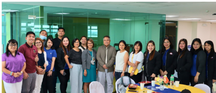
UP Baguio University Library benchmarking at Bulacan State University E- Library

Personnel of the University of the Philippines Baguio library personnel, conducted its benchmarking activity with the Bulacan State University E-Library on 30 March 2023, ending the first quarter of the year with a walk through of their newly launched E-Library catering to a total population of almost 40,000 students and faculty.