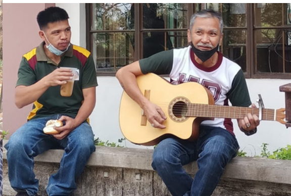
Members of the UP Baguio community taking a break and sharing a light hearted moment at PICafé

Whether it is to stay awake during late-night study sessions or to fuel early morning classes, coffee is a staple of the college experience. So when PIC launched a four-day free coffee project last 14- 20 April 2023, it quickly became a hit on campus. The idea was simple, provide free coffee to students at a designated location on campus. The project was initiated by the Program for Indigenous Cultures (PIC) with support from the Office of the Chancellor, Office of the Vice Chancellor for Academic Affairs, in partnership with the College of Arts and Communication and Ugnayan ng Pahinungod Baguio.