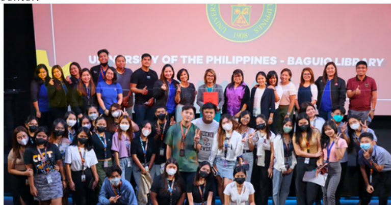
UP Baguio University Library benchmarking at Bulacan State University E- Library

Libraries learn by fostering partnerships and listening to the experiences of partner libraries. Information centers have evolved from just a shelf of books and a set of tables and chairs to what today is considered a smart learning space. Awesome facilities and wide learning spaces invite library users to stay in the library. In this digital era, libraries must be equipped with new tools and technologies (both people and facilities) that help in the advancement of services offered in every information center.