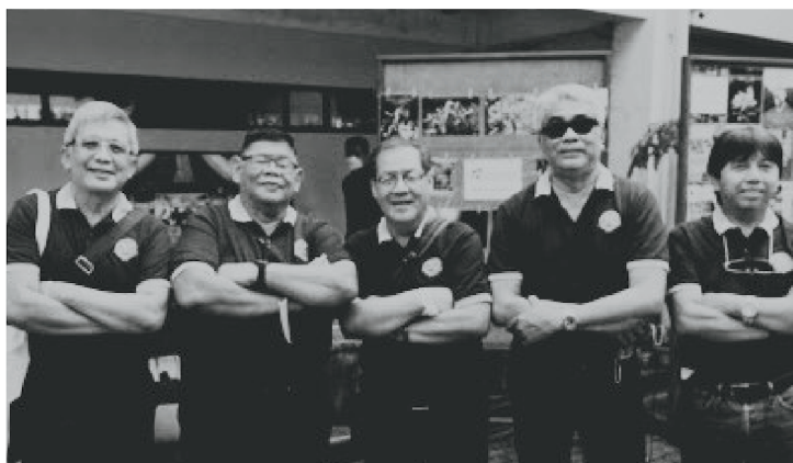
Pi Omicron Fraternity

Partner with us by giving to UP Baguio. Email us at alumni.upbaguio@up.edu.ph