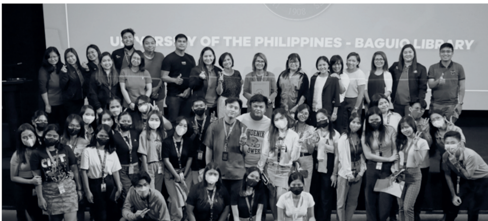
UP Baguio University Library benchmarking at Bulacan State University E-Library

Libraries learn by fostering partnerships and listening to the experiences of partner libraries. Information centers have evolved from just a shelf of books and a set of tables and chairs to what today is considered a smart learning space. Awesome facilities and wide learning spaces invite library users to stay in the library. In this digital era, libraries must be equipped with new tools and technologies (both people and facilities) that help in the advancement of services offered in every information center.