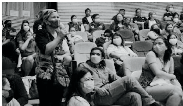
Nominations for the next UPAA Baguio-Northern Luzon Chapter Board members at the Teatro Amianan