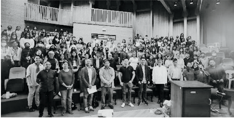
Participants from the McLuhan Forum held on March 24, 2023 at the UP Baguio Teatro Amianan