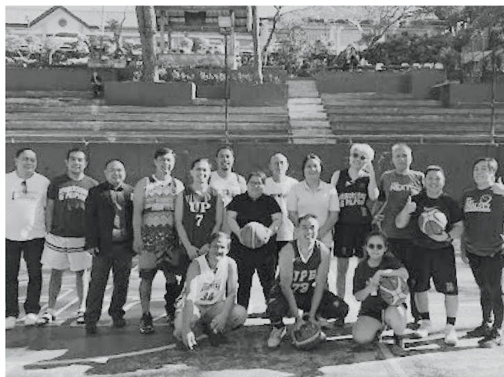
Alumni Basketball Players (men and women) at Court A

For film, television, theater, and the arts