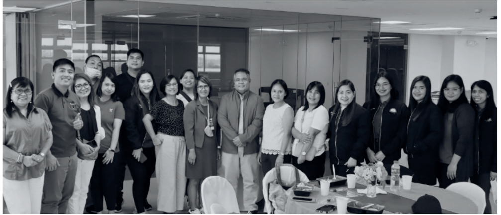
UP Baguio University Library benchmarking at Bulacan State University E- Library