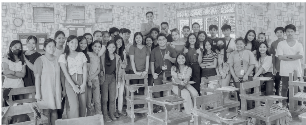
Group photograph of Ugnayan ng Pahinungod volunteers with students in Apayao