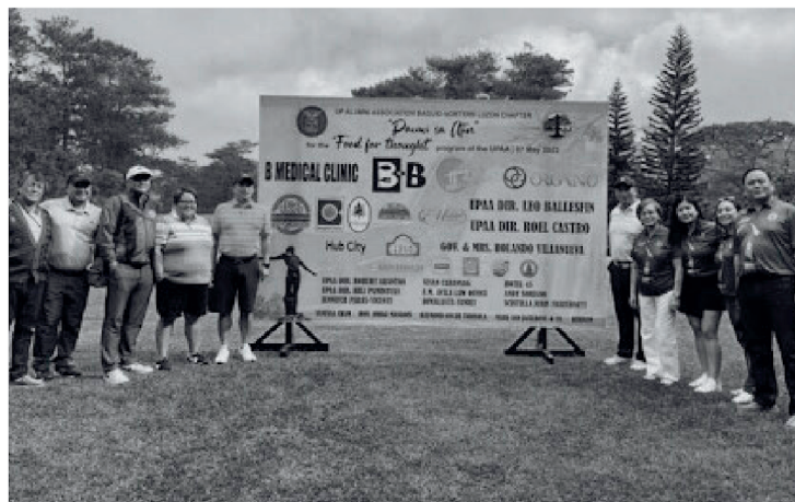
May 7, 2023 Gold Tournament at the Baguio Country Club. UP Alumni Association - National Board members with the Outgoing UPAA Baguio Northern Luzon Chapter Board Members