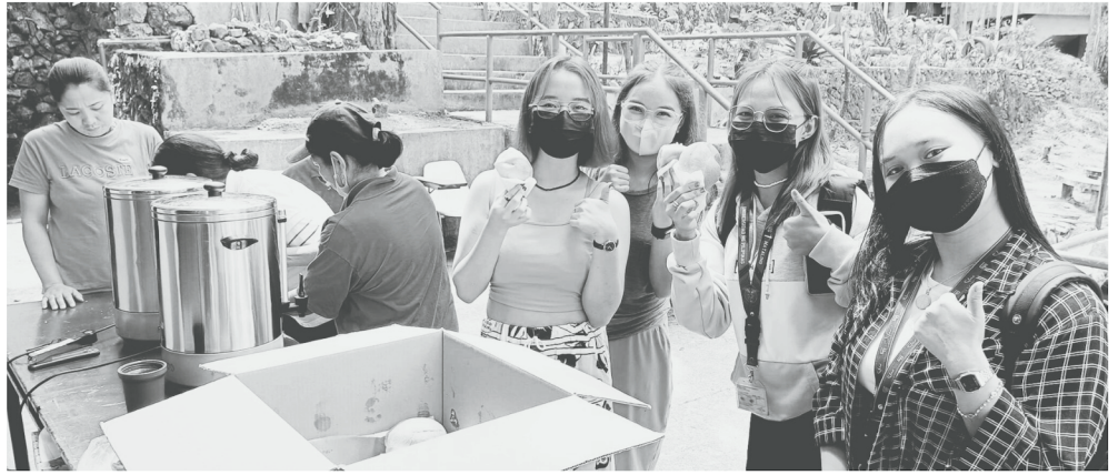
Members of the UP Baguio community taking a break and sharing a light hearted moment at PICafé

In the end, the project is more than just about consuming caffeine to stay alert and focused throughout the day. In offering free coffee, the school helped level the playing field for students who are already struggling to make ends meet by providing equal opportunity for them to succeed academically. More importantly, it was also about creating a warm atmosphere that fosters strong connection among different stakeholders on campus. Sometimes the simplest ideas can have the biggest impact.