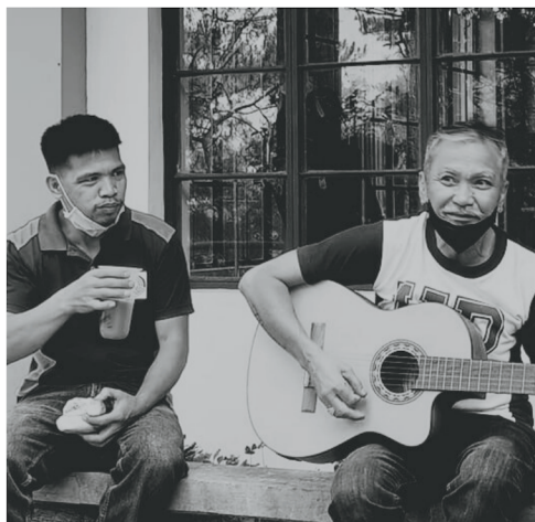
Members of the UP Baguio community taking a break and sharing a light hearted moment at PICafé