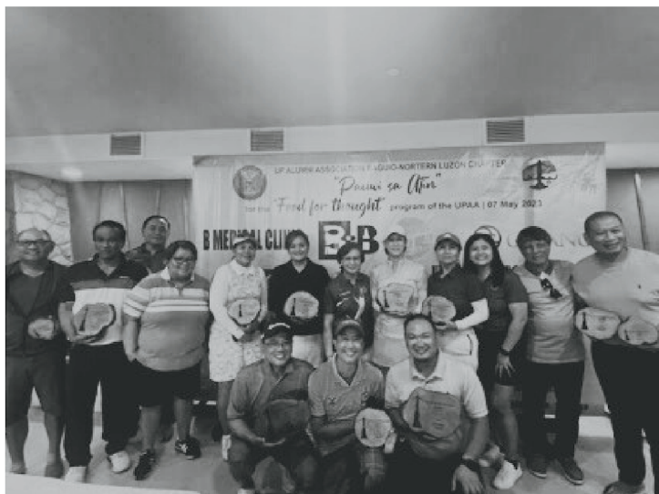
Winners of this year's Alumni Golf Tournament