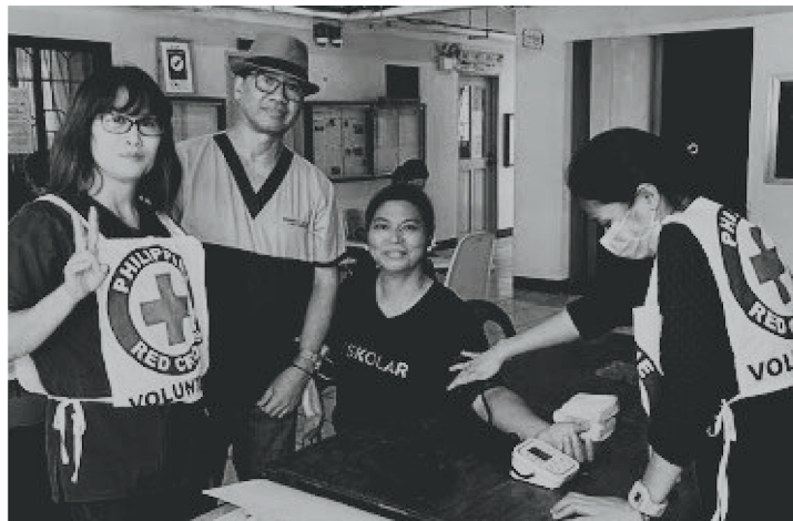
Blood Letting project with Red Cross-Baguio and Scintilla Juris